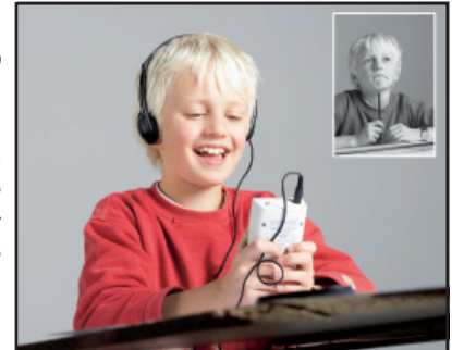
Training of central functions of hearing, seeing and of movement

A four-month-period of training basic functions led to significantly improved skills in reading and writing. The principal item of the Warnke-method is a small device called „Brain-Boy Universal“. Like playing a game children can improve seven basic functions concerning time und frequency resolution in hearing, seeing and motor skills. This way dyslexia is being reduced „from the bottom“.